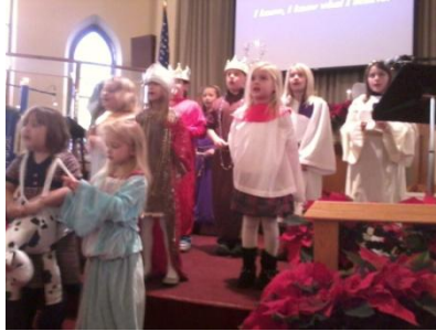
Miracle on Main Street